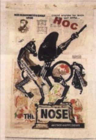
Artist William Kentridge's work on display

The Mumbai exhibition includes work from different projects — I Am Not Me, The Horse Is Not Mine, an installation of eight film fragments made in 2008 whilst working towards a production of Shostakovich's opera — The Nose — to a very recent tapestry that was produced from the poster made for the same production at the Metropolitan Opera in 2010. One recurring theme seems to be fragmentation and coherence — the eight-film fragments, two